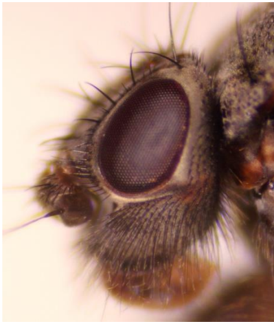
Coelopa pilipes (Coelopidae)