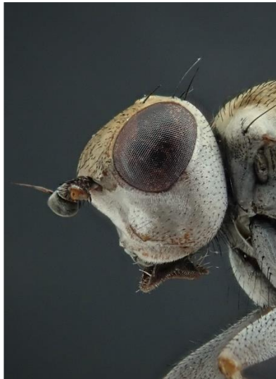
Helcomyza ustulata (Helcomyzidae)