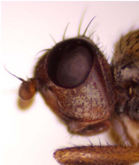
Heterocheila buccata (Heterocheilidae)