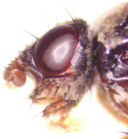
Coelopa frigida (Coelopidae)