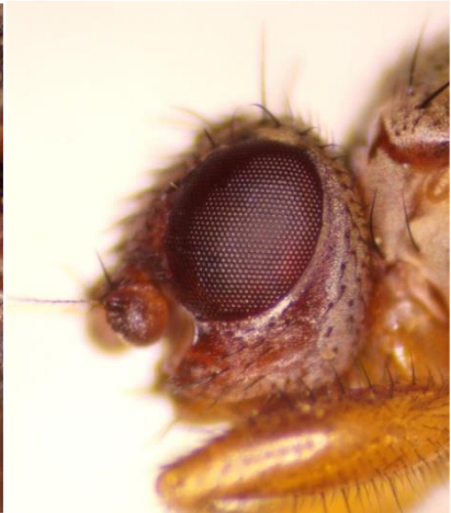
Malacomyia sciomyzina (Coelopidae)