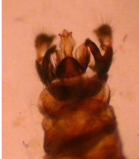
Dicranomyia occidua (VV) to show the aedeagus and the flattened leaf-like parameres. (Compare this with the drawing in Podenas et al.)

Antocha vitripennis is a variable species in that the body colour ranges from yellow to dark brown.