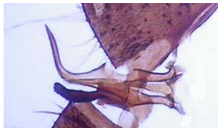
Male aedeagus of Tasiocera murina

Adrian Plant, our expedition leader, set up a Malaise trap in the Ashwood, for the week. This yielded a further 7 species of craneflies. This included a female of what was perhaps Limonia stigma , with 7 grey mites attached. This species is very similar to Limonia phragmitidis , also found at this site, with black tips to the femora, although in the latter species, the black does not run to the tip itself, which is pale. There seems to be intermediate examples, ( check your collections and let me know ! ) which makes me unhappy about the identification, unless I can use the male genitalia. The tiny black, 'hairy' Tasiocera murina was also identified from this sample.